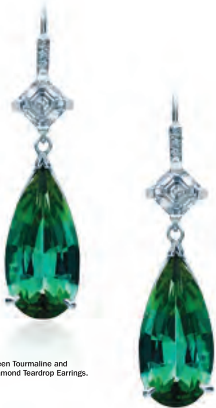
Green Tourmaline and Diamond Teardrop Earrings.