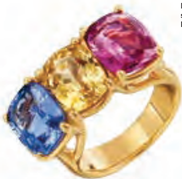
Multi-colored sapphire ring in 18 Kt yellow gold.