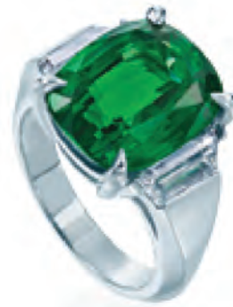
Rare Tsavorite, 'Green Garnet'