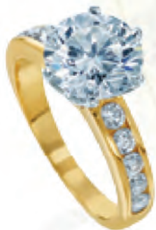
Tiffany Diamond Ring