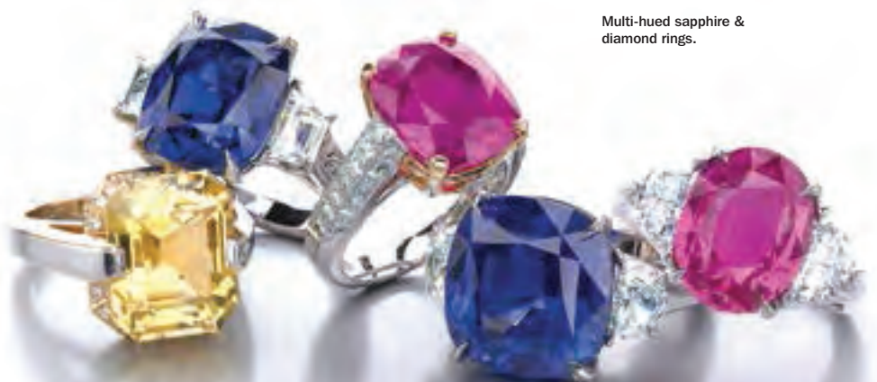
Multi-hued sapphire & diamond rings.