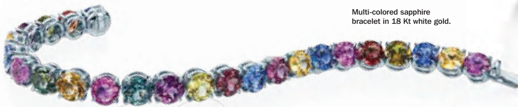
Multi-colored sapphire bracelet in 18 Kt white gold.