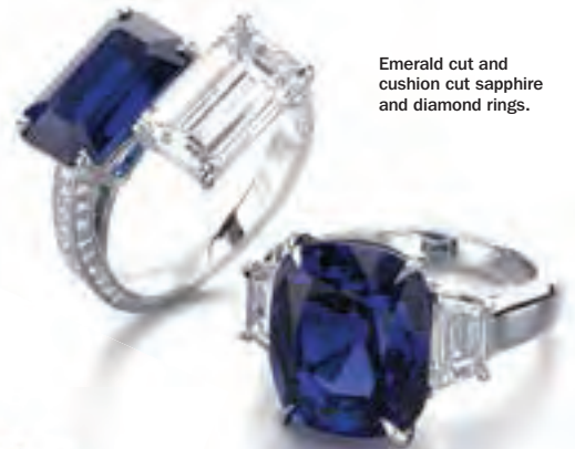
Emerald cut and cushion cut sapphire and diamond rings.