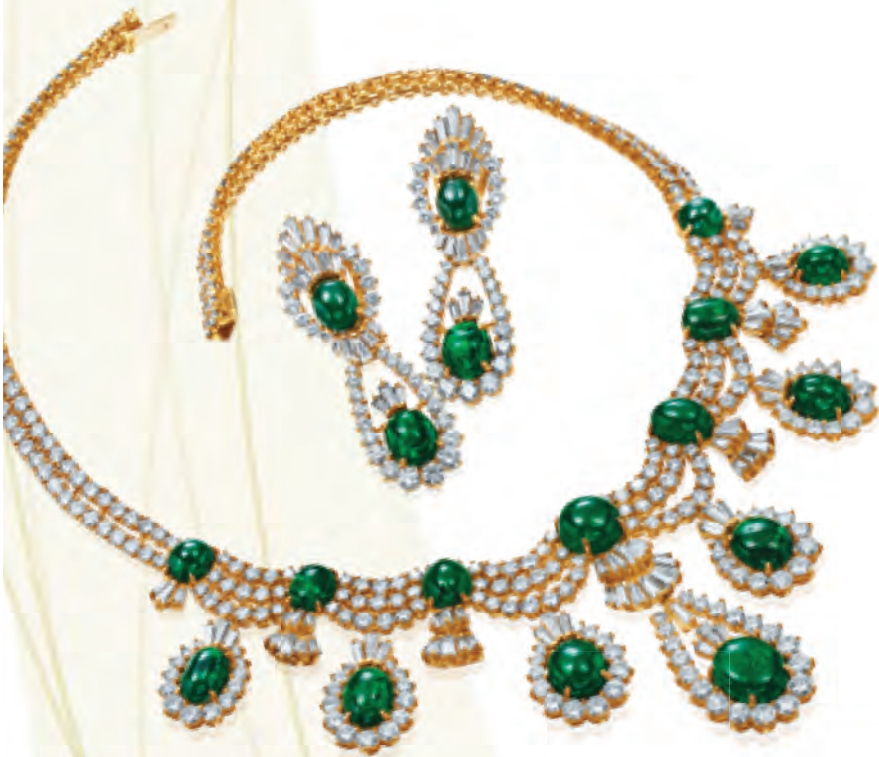
Fred Leighton Cabochon Emerald and Diamond Necklace and Earrings