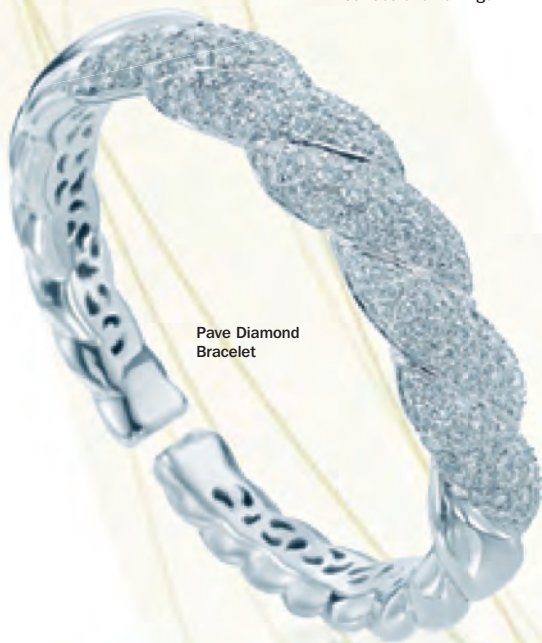
Pave Diamond Bracelet