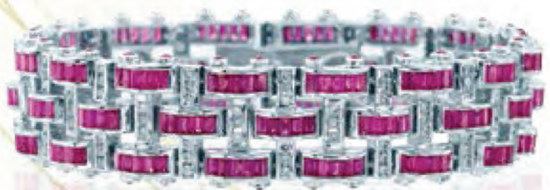
Ruby and Diamond Bracelet