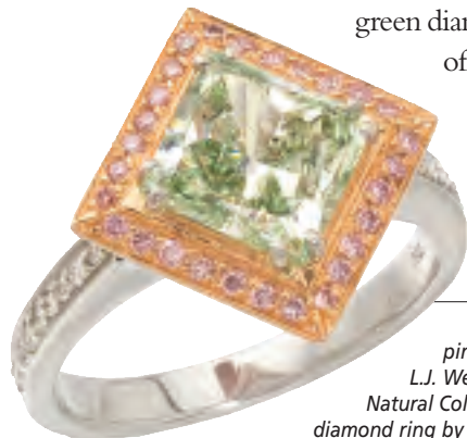
Top: Green diamond ring with fancy pink and white diamond accents by L.J. West Diamonds Inc., left: Green diamond ring by Scarselli Diamonds/NBS Diamonds.