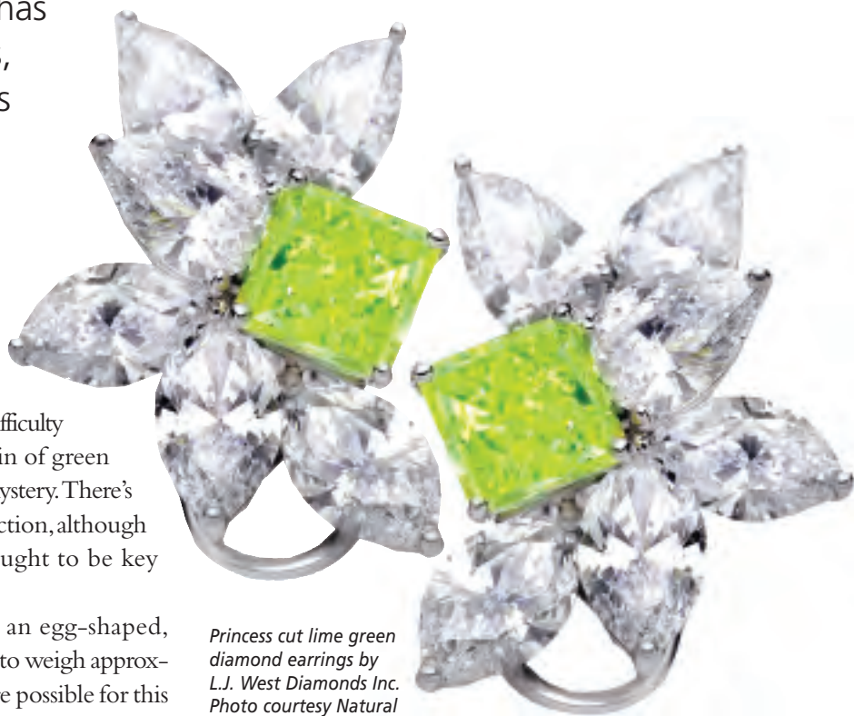
Princess cut lime green diamond earrings by L.J. West Diamonds Inc.

The historic Dresden Green diamond, an egg-shaped, slightly grayish Green VS1 stone, is estimated to weigh approximately 41 carats. No exact measurements are possible for this legendary gem housed in Dresden, Germany. The celebrated